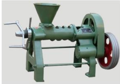
◆6YL-68 screw oil press Capacity: 50kg/h Power: 5.5kw Weight: 150kgs

We produce different kinds of oil press machinery which can be widely used in pressing oil from different seeds, such as soybean, peanut, sunflower seeds, cotton seeds, sesame, tea seeds, copra, jatropha seeds, castor seeds etc.