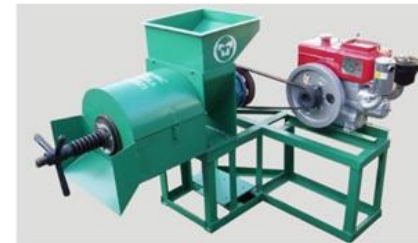
◆VIC-1 palm fruit oil press Capacity: 300-500kg/h Main shaft speed: 25-35r/min Power: 3-4.5kw motor/6-7hp diesel engine Dimension: 1400x600x600mm Weight: 260KG