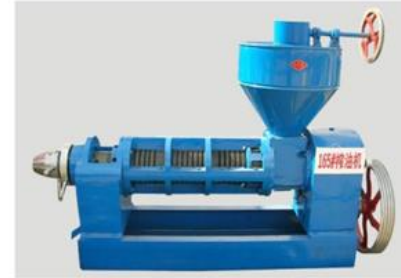
◆6YL-165 screw oil press Capacity: 600-700kg/h Power: 30kw Weight: 1200kgs