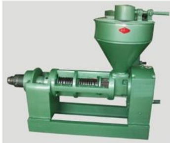
◆6YL-95 screw oil press Capacity: 150kg/h Power: 7.5kw Weight: 500kgs