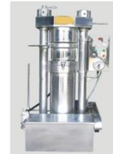
◆6Y-230 hydraulic oil press Capacity: 50-80kg/h Power: 1.5kw Size: 1050x950x1650mm Weight: 800kgs