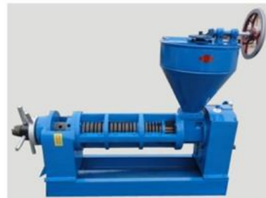
◆6YL-120 screw oil press Capacity: 250-300kg/h Power: 11-15kw Weight: 800kgs