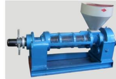
◆6YL-160 screw oil press Capacity: 400-500kg/h Power: 18.5-22kw Weight: 1000kgs