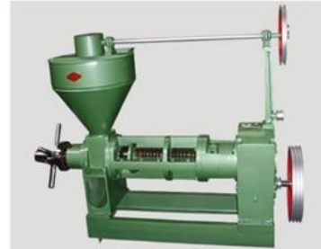
◆6YL-80 screw oil press Capacity: 100kg/h Power: 5.5kw Weight: 300kgs